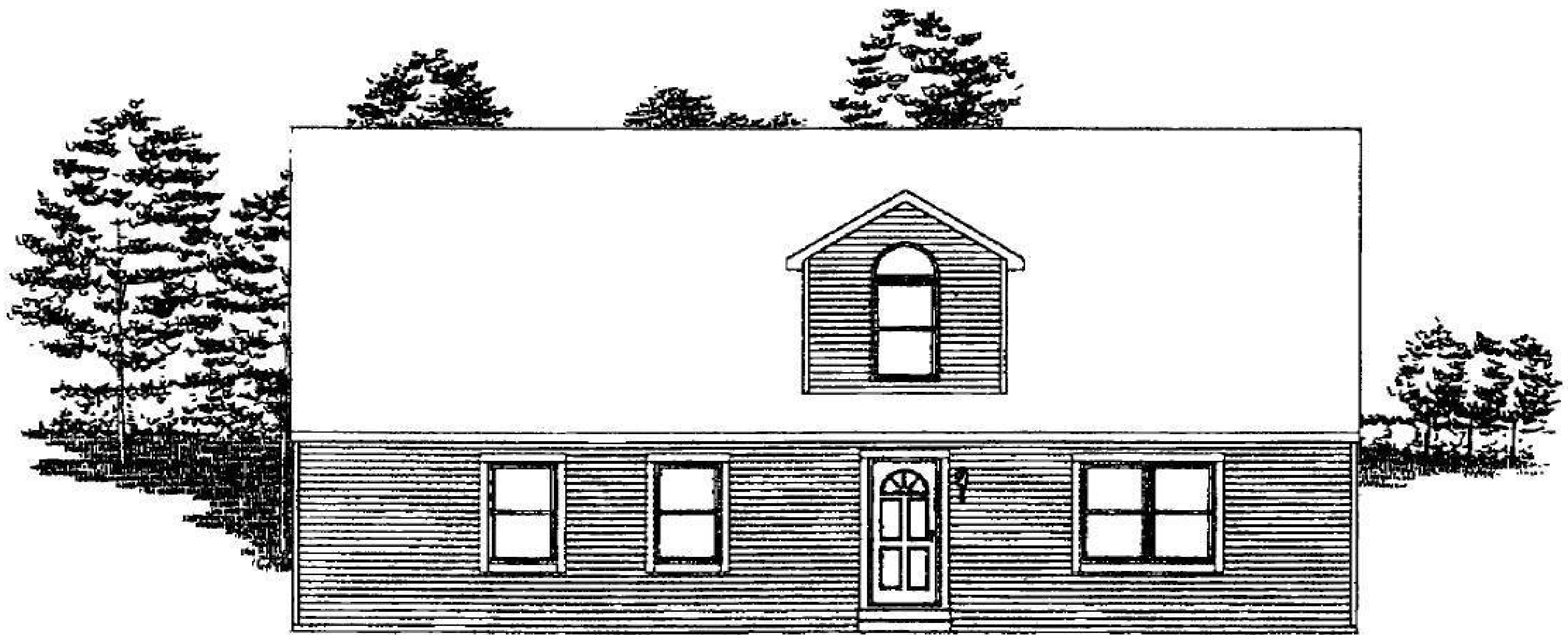
AMBER 28 X 50 1,400 SF