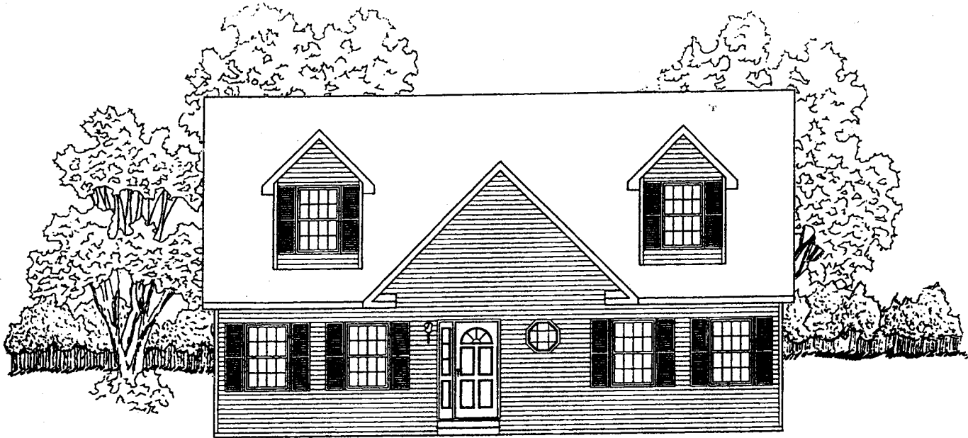
DILLON I 28 X 40 1,120 SF